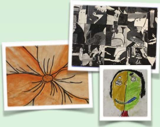
Work from the 2016 Anson Art Festival

This booklet provides information for parents and carers on the end of year expectations for children in our school. The staff have identified these expectations as being the minimum requirements your child must meet in order to ensure continued progress throughout the following year.